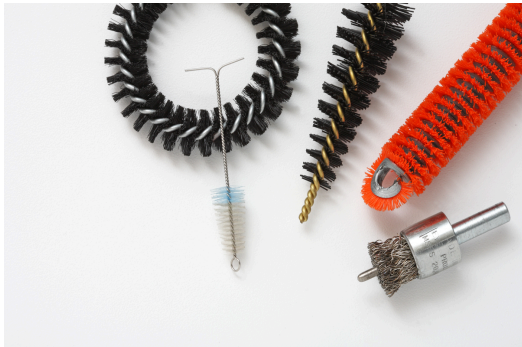
Photo: Custom-designed brushes manufactured by The Mill-Rose Company.